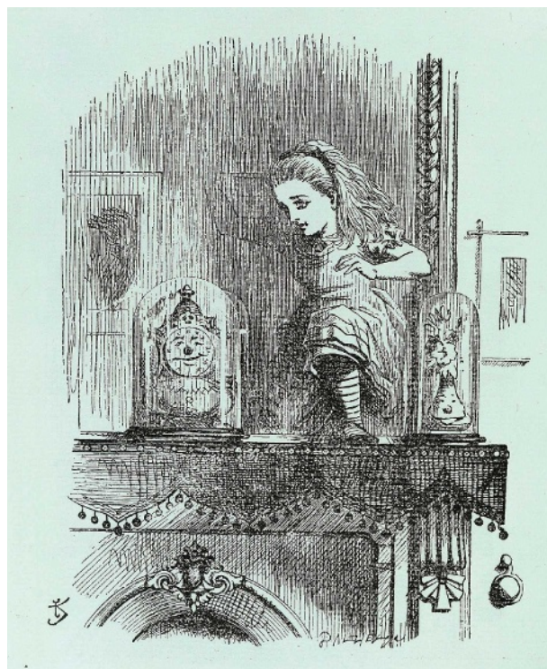
Figure 1 | Molecules through the looking-glass. The molecules of life in Alice’s looking-glass world would be mirror images of those in ours, and should work just as well. So why don’t they exist?

More than 50 years ago, the theoretical physicist Charles Frank addressed the existence of single-handed biomolecules in what became a much-cited paper 3 . He commented: “I have long supposed that this was no problem on the basis of a supposition that the initial production of life is a rare event.” He went on to prove